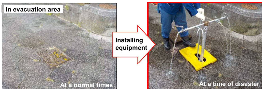
(b) Temporary type