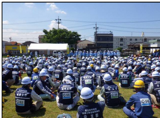
(a) Training venue

Previously, our Bureau had participated alone in disaster reduction drills held in the local community, such as voluntary disaster reduction drills held by neighborhood association in