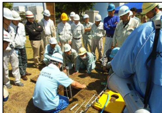
(d) Training on installing temporary water faucets