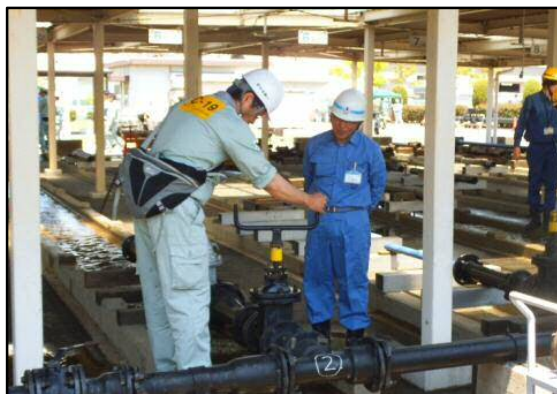
(c) Training on operating a gate valve