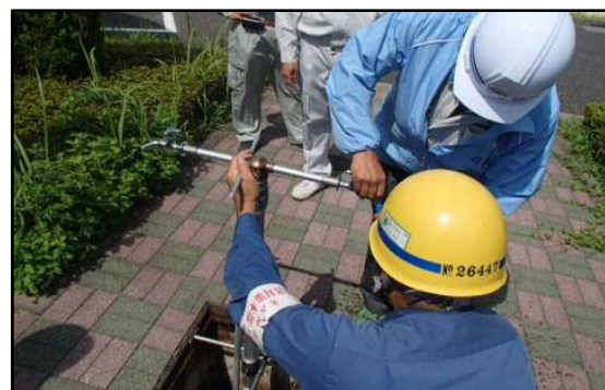
(b) Training on installing temporary water faucets