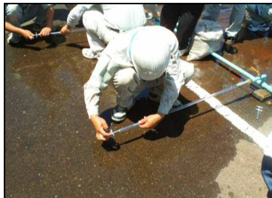
(b) Training on emergency stopping water