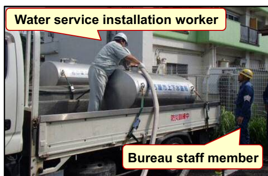
(a) Training on loading a vehicle with a water supply tank (1 m 3 )

Our Bureau holds a disaster reduction drill in September every year. The emergency water supply activity training is also one of the implementation items. Since 2012, when we concluded the new Disaster Mutual Aid Agreement, with the purpose of strengthening our cooperation with Meisuikyo at the time of a disaster, we have held cooperative emergency water supply activity training with Meisuikyo. In this emergency water supply activity training, our Bureau and Meisuikyo jointly conduct training on loading a vehicle with a 1 m 3 water supply tank, training on