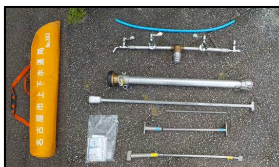
Figure 5. Temporary water faucet

The conclusion of this agreement has allowed our Bureau to entrust the temporary water faucets to be installed in emergency water supply facilities to Meisuikyo, and, at the time of disaster, to have a system in which designated member water service installers of Meisuikyo, on behalf of our Bureau, can install temporary water faucets after going into action at emergency water supply facilities.